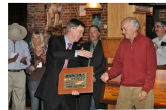
Denver Mayor John Hickenlooper and John Fielder at the 2009 BBB

Think you had fun at the 2009 Brews, Boots & Bucks? Just wait until the 2010 version. Mark it on your calendar now. Nov. 4, 2010. More information and sponsor opportunities available soon.