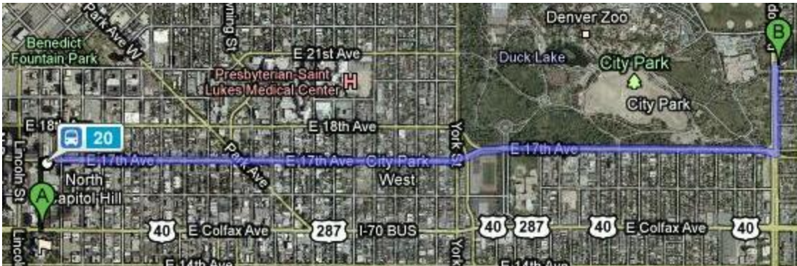
Point A: State Capitol